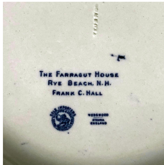
Back of Farragut plate

Not unlike we do today, in the late 19th/early 20th centuries, vacationers up and down the eastern seacoast brought home various pictorial knick-knack souvenirs as remembrances of their time away from home. Those coming to Rye, one of New Hampshire and New England's go-to summer destinations, were no different. Visitors to the magnificent Farragut House/Hotel expected, and found, high-end souvenirs like the English-made Wedgwood china piece pictured above. Measuring approximately 9" in diameter, this flora-bordered blue and white plate has been donated to the Rye Historical Society by Blair Nelson and Lee Seaver. What a beautiful addition to our collection!