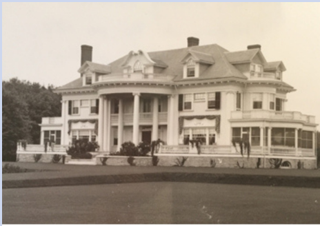
Free Self-Guided Rye Beach Block Tour izi.TRAVEL