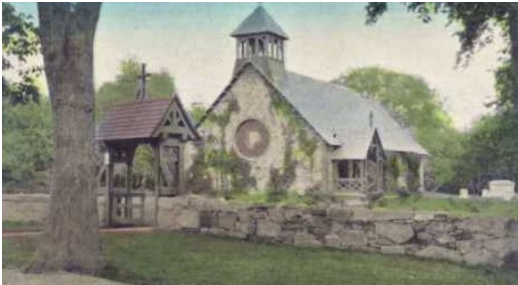
St. Andrews, Rye, New Hampshire - 1910

During the first four months of this year when the museum had no set hours, 100 people visited because they made an appointment by telephone or e-mail. On most occasions we can accommodate any time request.