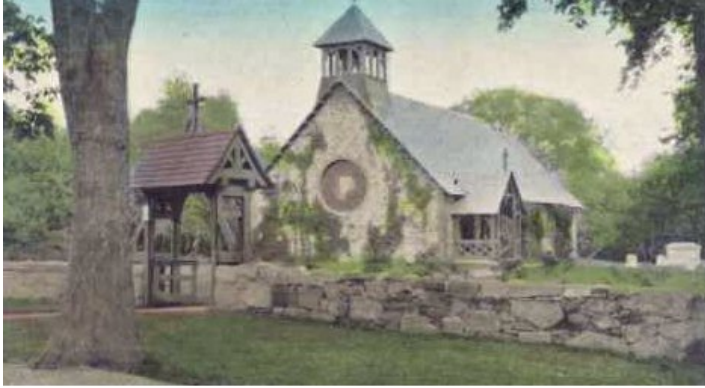
St. Andrews, Rye, New Hampshire - 1910

And many thanks to all who attended, joined the RHS or renewed their membership!